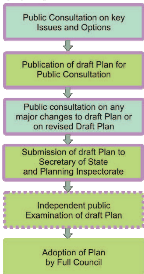
Figure 1: Key stages in preparing DPDs